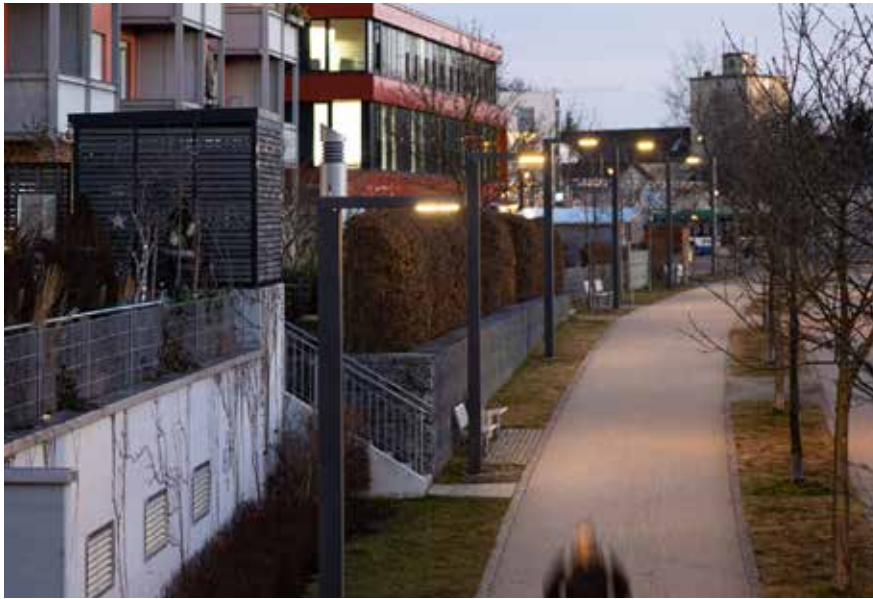
merkur residential area / DE