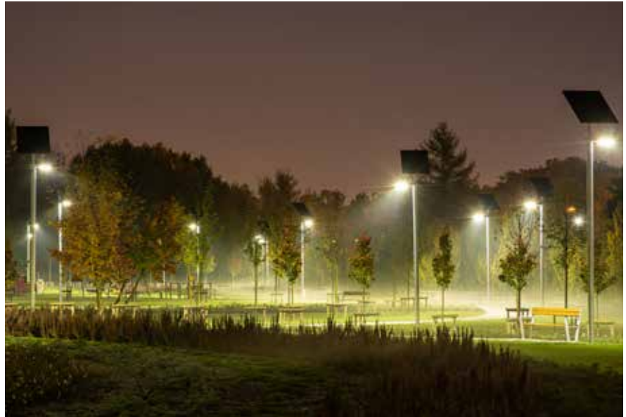
protos Park / PL