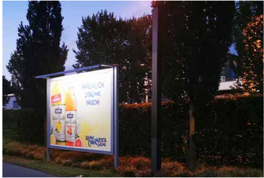
Energy tower Illumination billboard / DE