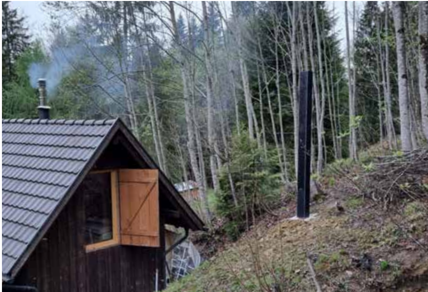
Energy tower energy source / AT