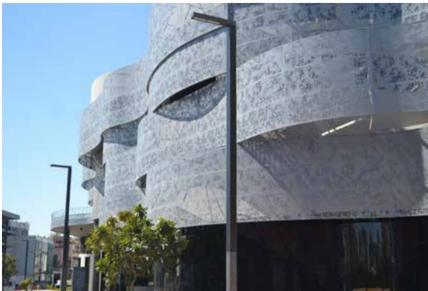
merkur Adliya district / BHR