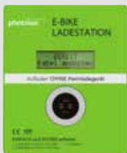
Energytower with e-bike charging station